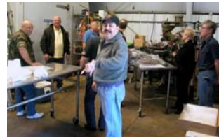
Our friends and brothers at Garden Oak's #1306 cook briskets for Holland's fundraiser!