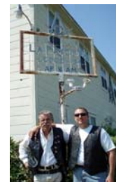
Pictures from Holland's first ever charity motorcycle run to LaFayette #34 in LaGrange.