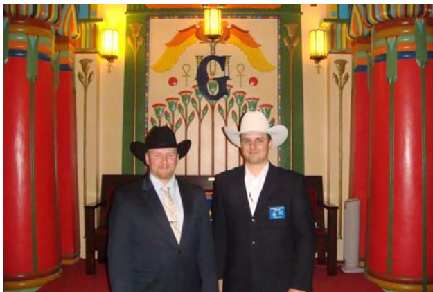
The East at the Harmony #6 FC Degree with WM's Wood & Porter.