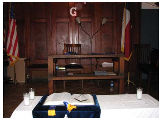
The East at the Rice Degree