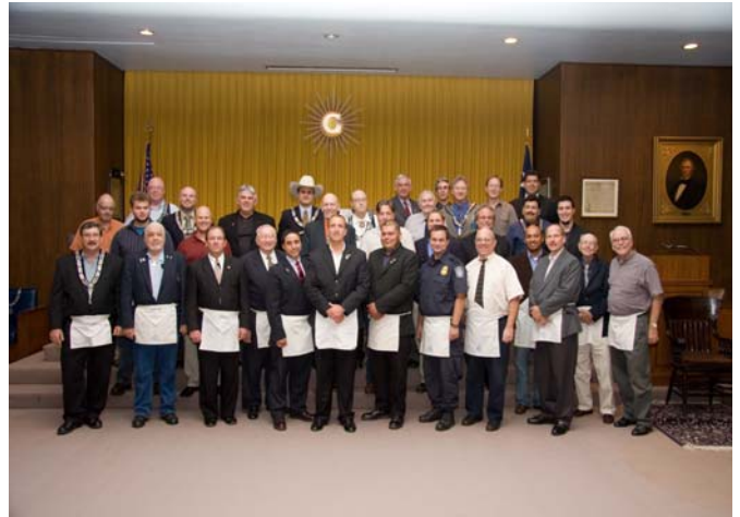
The Final Snowball Visitation Team at Holland Lodge #1