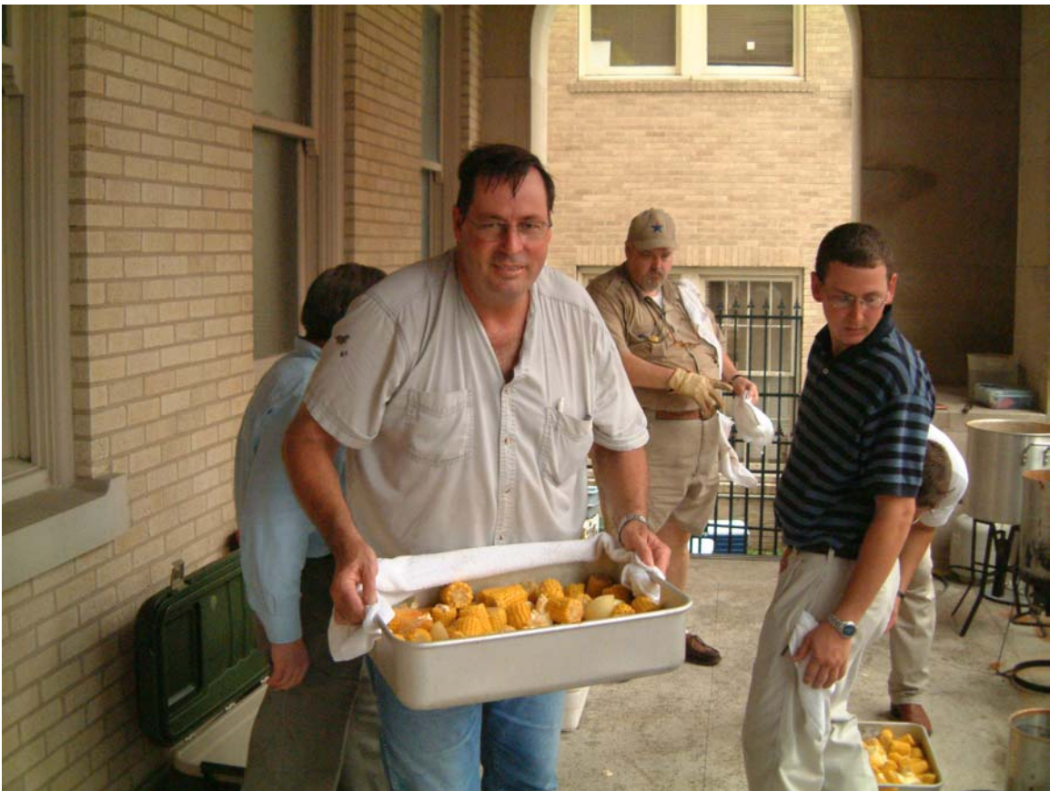
The corn and potatoes cooked up under Bro. Thompson direction and were great.