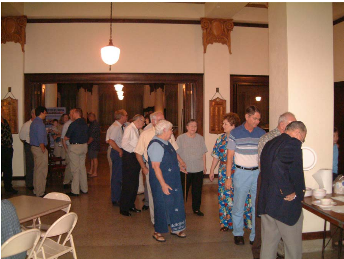
The serving line formed quickly. Holland had 20 Masons present and the families and kids of the Harmony Brothers came and everyone enjoyed the lunch, shrimp and Fellowship.