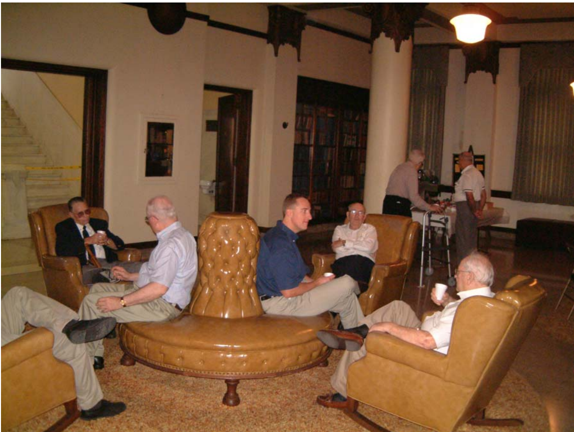
Several Brothers waiting lunch. The Scottish Rite Temple is a beautiful building with many interior touches that make it very special.