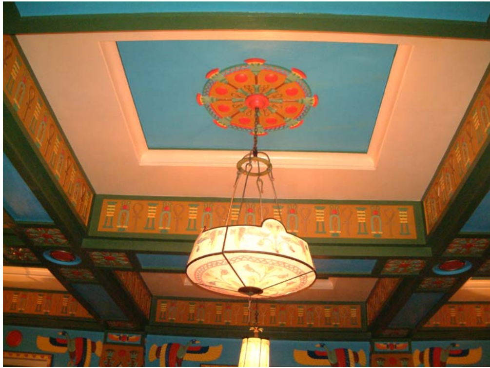
The ceiling and light fixtures were stunning.