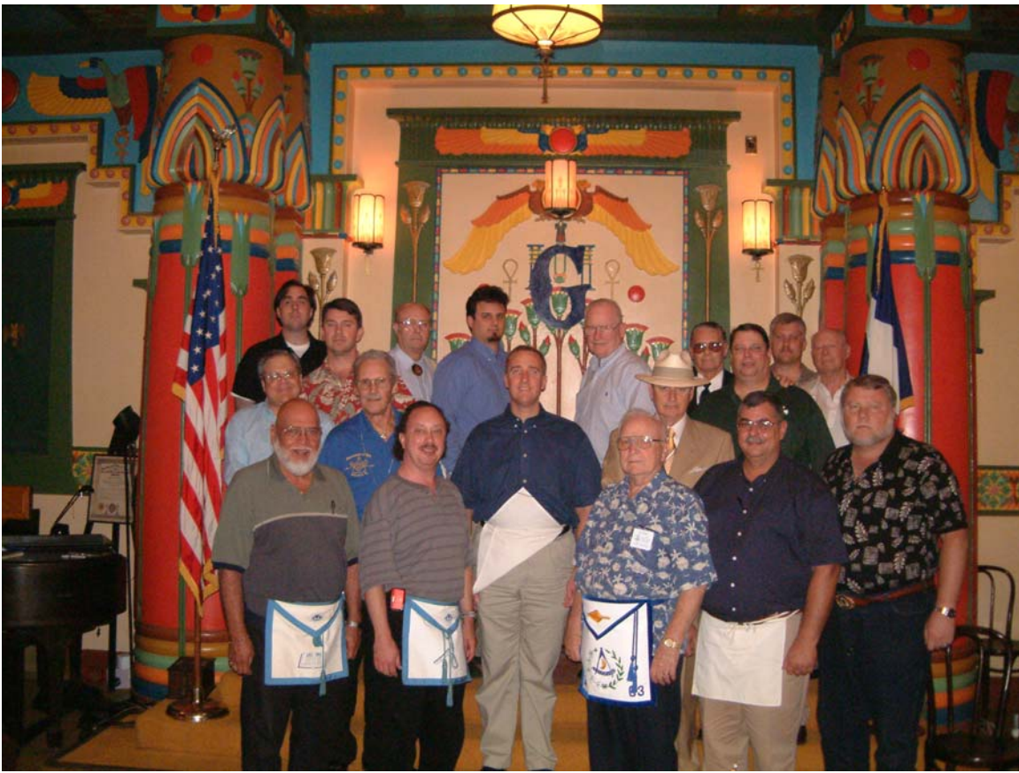
The new FC, Degree Team and Officers of Harmony Lodge.