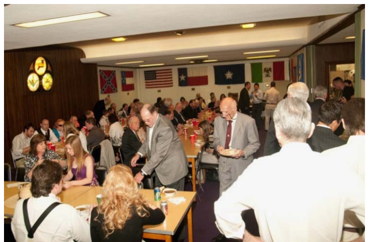
Holland Lodge's dining room was at capacity for the 175 th anniversary lunch. More than 150 people attended the event.