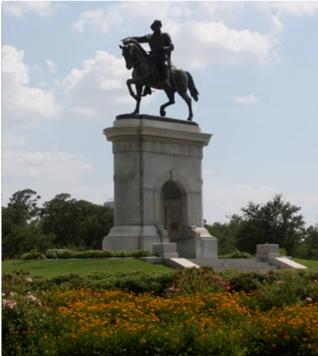
The Sam Houston Memorial Statue in Herman Park Houston, Texas. Brother Houston was a charter member of Holland Lodge No. 1.