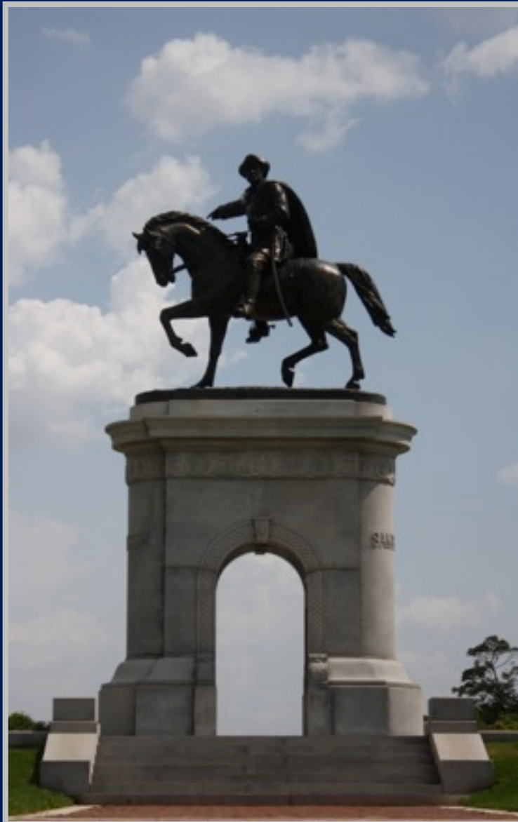
The Sam Houston Memorial Statue in Houston, Texas