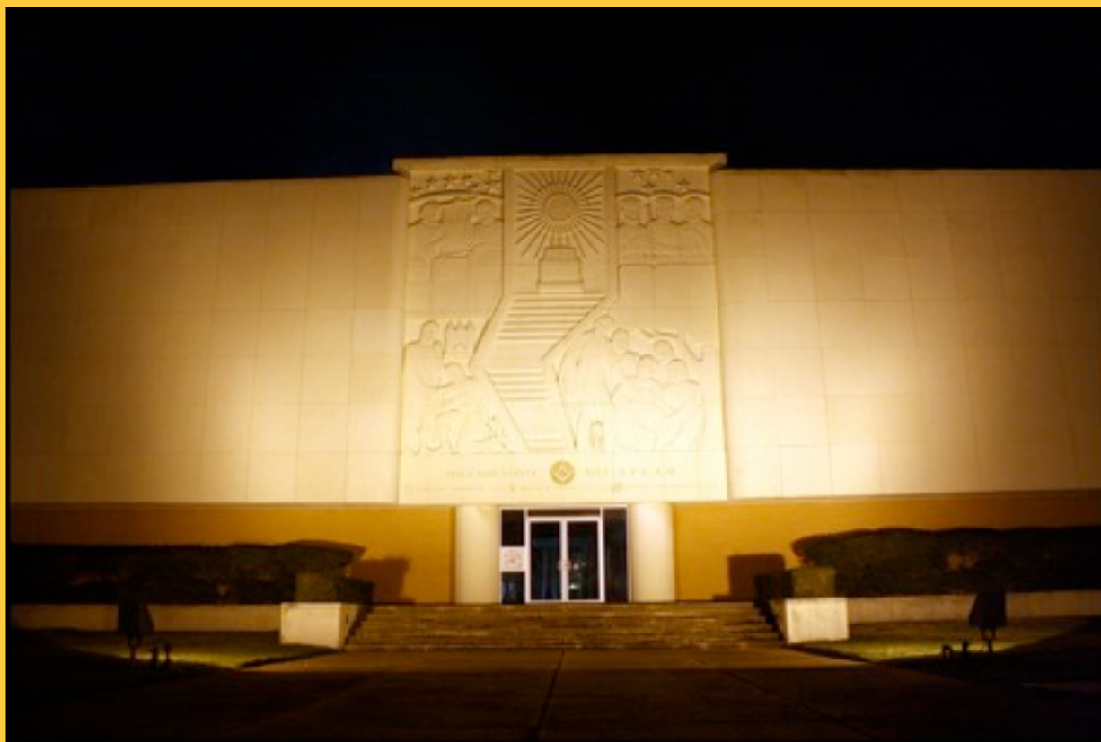
Photograph by Brittany Lucas